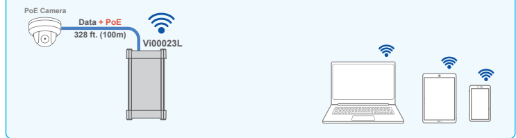
The Vi00023L enables connecting the PoE cameras to any wireless device using a WiFi connection.