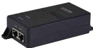
Vi2201 Single Channel PSE