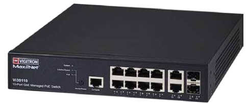
Vi30110/ Vi30126 Series Industrial Network Switches Desktop Network Switches