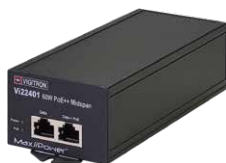
Vi22401 Single Channel PSE

Many times you need to add a light to an existing camera installation but already have one cable installed. Code Blue – Vigitron solutions allow you to add combine multi device Power and Video on a single cable.