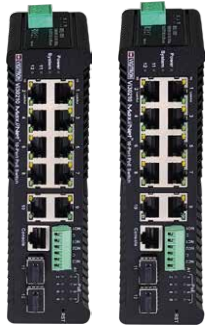
Vi30210 / Vi30208 Industrial Network Switches Harden Industrial Network Switches