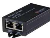
Vi30103 3 Port PoE Switch/Repeater